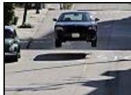
Photos: Famed chase re-created