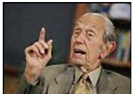
Doomsday prophet: Oops, we goofed