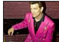
All-time sexiest men of pop music