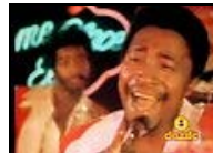
'Disco Inferno' singer dies (video)